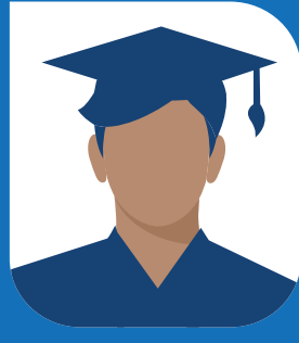
SAL THE SAVVY PHARMACY STUDENT

Navigating managed care pharmacy can be challenging for you as a student pharmacist. With limited exposure to the field, you may feel uncertain about how it fits into your career, and you might struggle with what comes next after graduation. Without access to tailored learning or mentorship, developing the skills and expertise needed to succeed in managed care can be difficult, leaving you unsure of how to move forward.