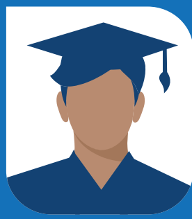
SAL THE SAVVY PHARMACY STUDENT