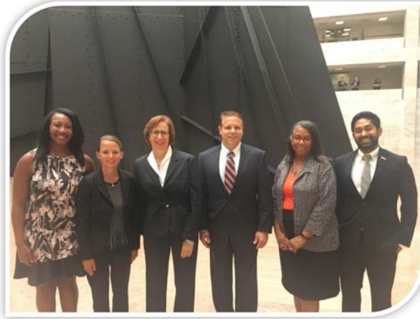
AMCP members participating in 2017 Lobby Days