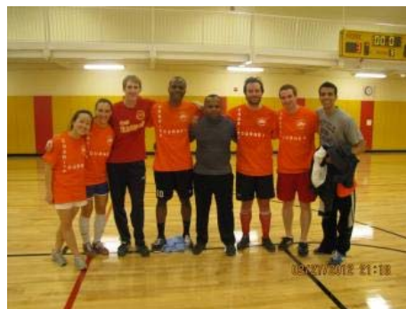
First place winners

The annual tournament, held this year at the Pratt Gym in the Southern Management Corporation Campus Center, drew the support of students from the University of Maryland (UM) Schools of Pharmacy, Medicine, Dentistry, Law, and Nursing. Participants put aside their lab coats, scrubs, books, and instrument kits to show off their soccer skills for three full hours in front of a large audience of their peers and guests. Eight teams participated, and the event raised $580 from registration fees and donations.